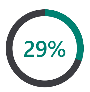
Just 29 percent are actually acting on that data.9

As your business grows, it can become hard to keep track of sales and sales rep performance. Competing priorities arise, and sometimes your team isn't on the same page. Sales reps and leaders need to see how they're performing against business goals in order to set objectives, make decisions, and maintain accountability. If your sales tools can't measure and report on which types of customer interactions consistently convert to revenue or how to turn metrics into actionable insights that improve the sales cycle, your team could be missing the mark.